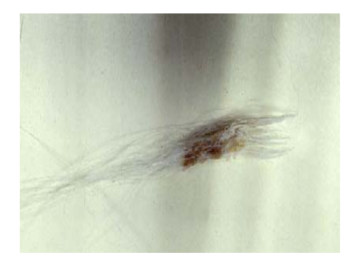
Fig.: 2 Clump of hairs (2)

SA is normally nonpruritic unless there is a secondary staphyloccal skin infection and even furunculosis may develop.